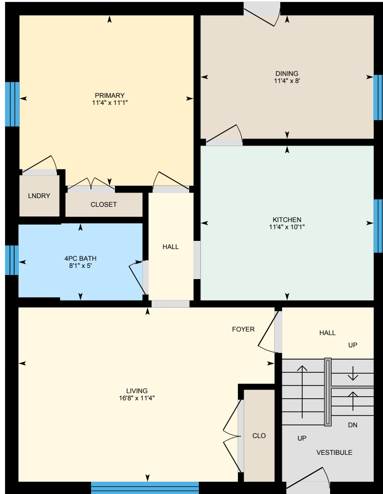
Main Floor Exterior Area 799.72 sq ft

Main Building: Total Exterior Area Above Grade 799.72 sq ft