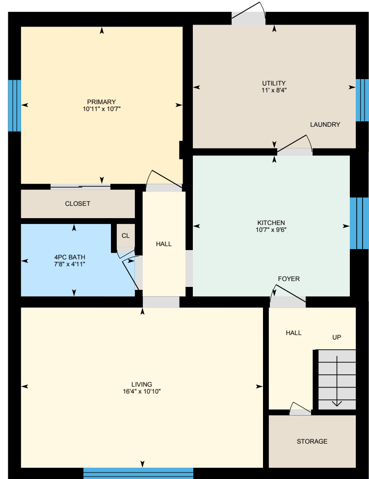
Basement (Below Grade) Exterior Area 766.75 sq ft