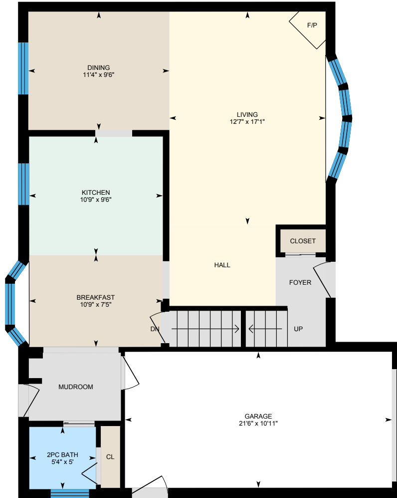
Main Floor Exterior Area 829 sq ft

Main Building: Total Exterior Area Above Grade 1927 sq ft