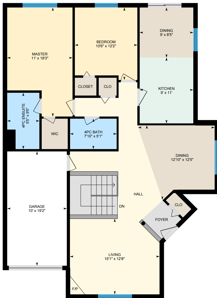
Main Floor Exterior Area 1348 sq ft

Main Building: Total Exterior Area Above Grade 1348 sq ft