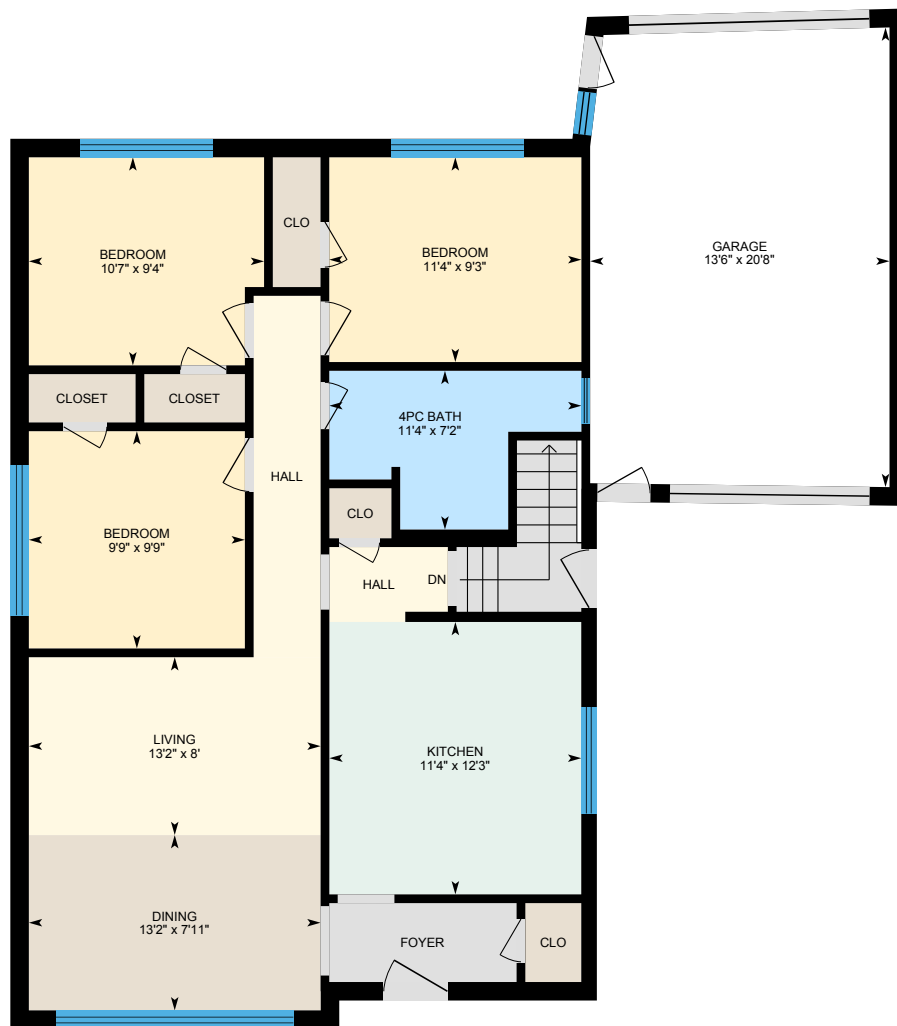
Main Floor Exterior Area 1048 sq ft

Main Building: Total Exterior Area Above Grade 1048 sq ft