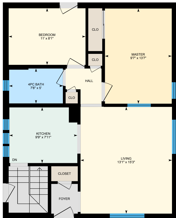
Main Floor Exterior Area 774 sq ft

Main Building: Total Exterior Area Above Grade 774 sq ft