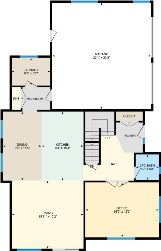
Main Floor Exterior Area 1134 sq ft

Main Building: Total Exterior Area Above Grade 2064 sq ft