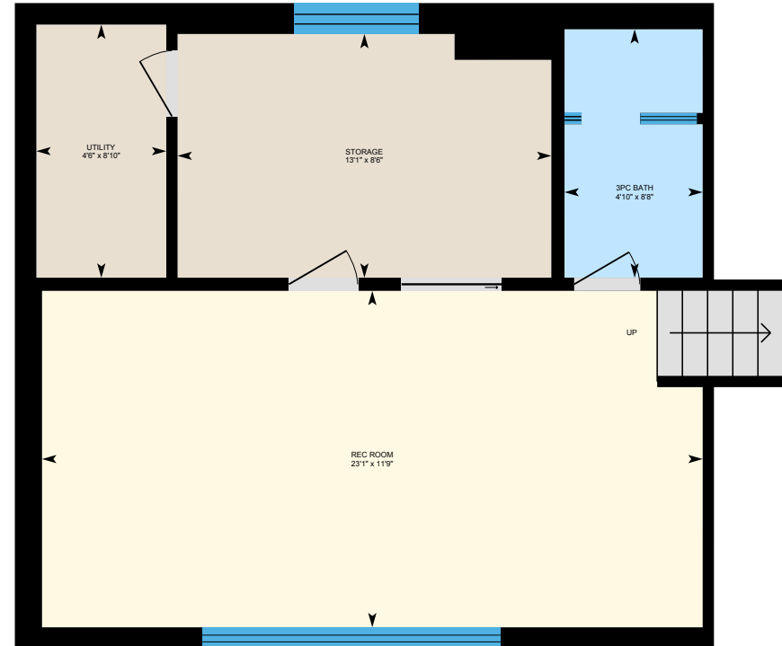
Basement (Below Grade) Exterior Area 550 sq ft