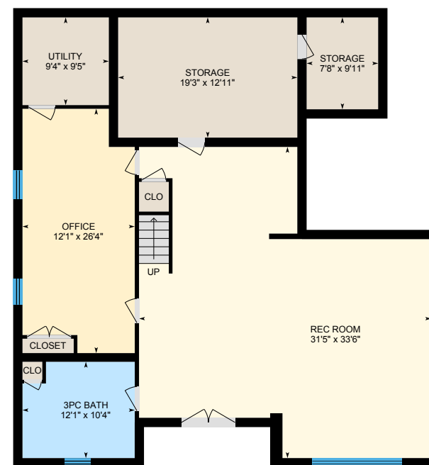
Basement (Below Grade) Exterior Area 1974.69 sq ft