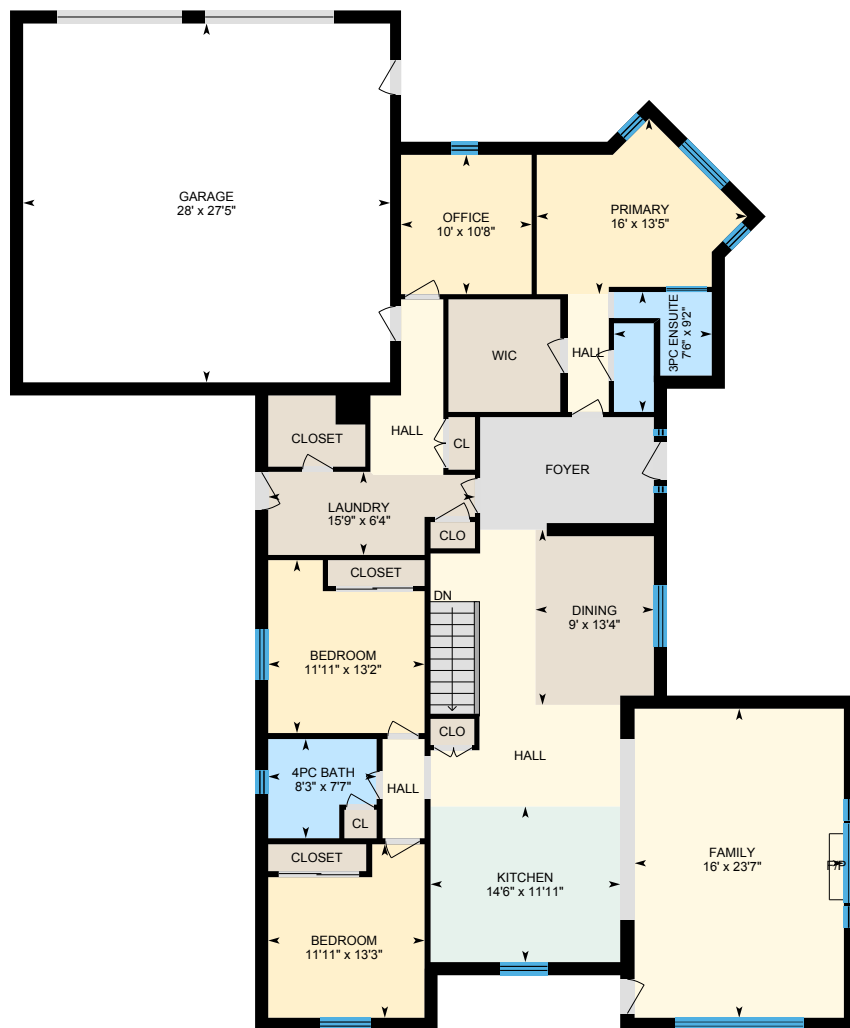
Main Floor Exterior Area 2359.92 sq ft

Main Building: Total Exterior Area Above Grade 2359.92 sq ft