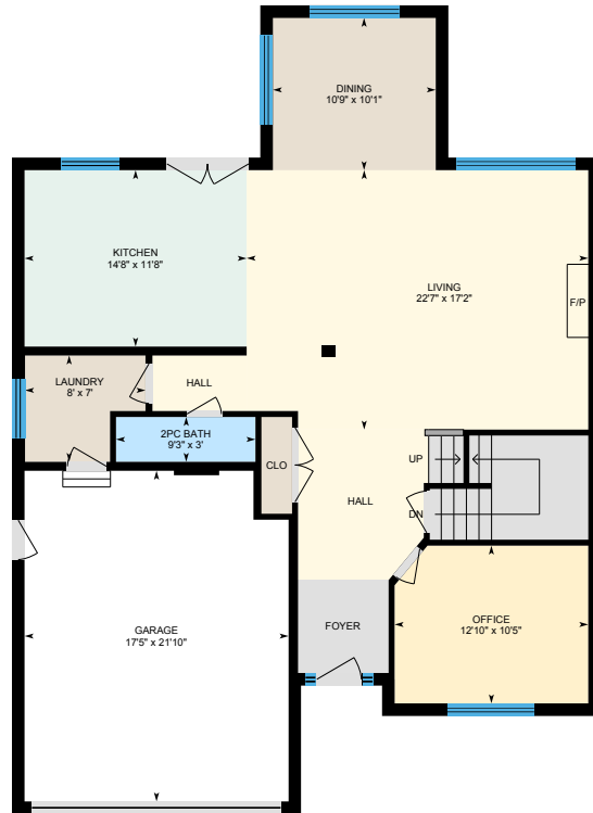
Main Floor Exterior Area 1262.55 sq ft

Main Building: Total Exterior Area Above Grade 2507.10 sq ft