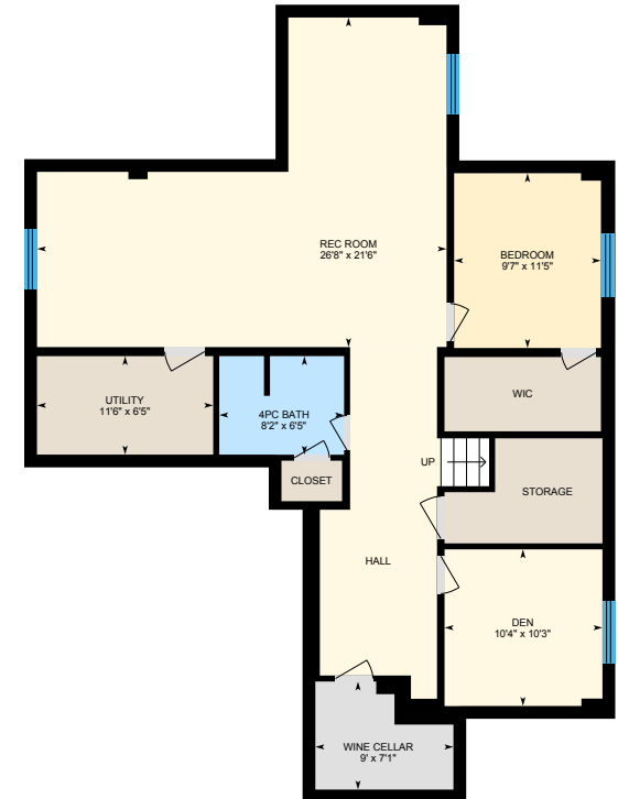
Basement (Below Grade) Exterior Area 1288.79 sq ft