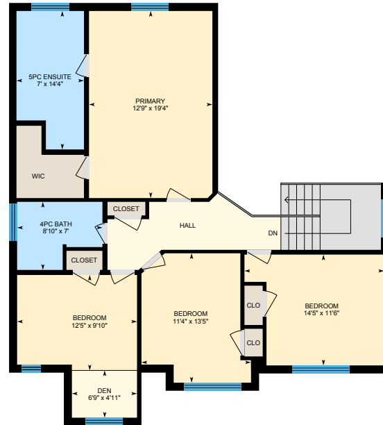
2nd Floor Exterior Area 1244.55 sq ft