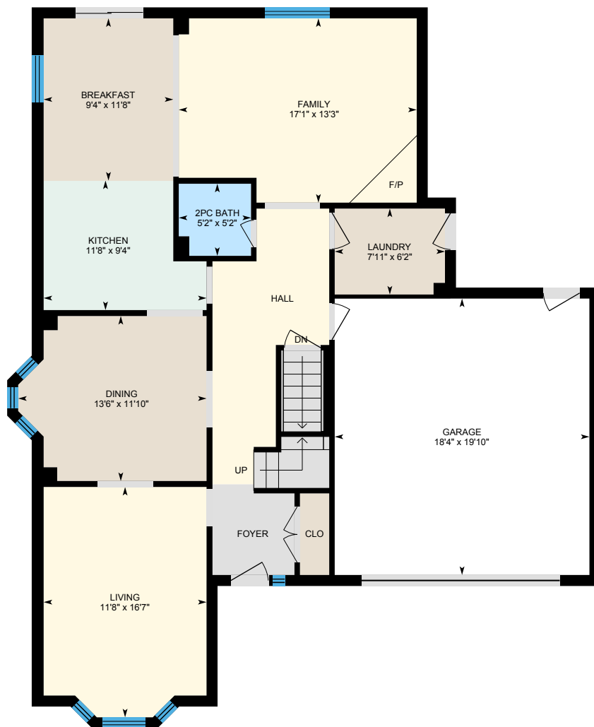
Main Floor Exterior Area 1196.65 sq ft

Main Building: Total Exterior Area Above Grade 2273.20 sq ft